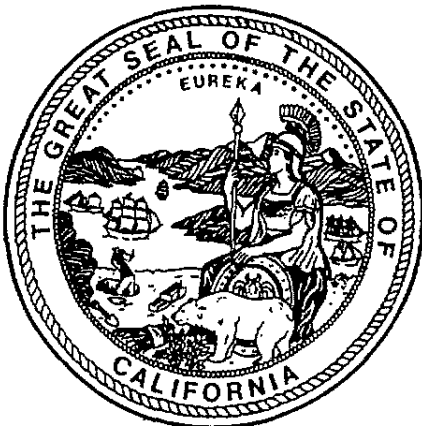
BRUCE McPHERSON Secretary of State

IN WITNESS WHEREOF , I execute this certificate and affix the Great Seal of the State of California this day of June 14, 2005.