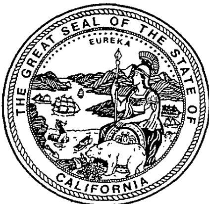
BRUCE McPHERSON Secretary of State

IN WITNESS WHEREOF , I execute this certificate and affix the Great Seal of the State of California this day of June 10, 2005.