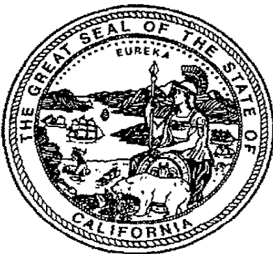
BRUCE McPHERSON Secretary of State

IN WITNESS WHEREOF , I execute this certificate and affix the Great Seal of the State of California this day of June 4, 2005.