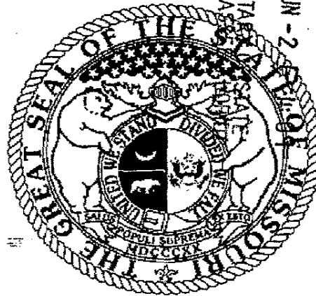
Secretary of State

Certification Number: 7683956-1 Reference: Verify this certificate online at http://www.sos.mo.gov/businessentity/verification