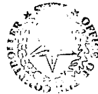
Carole Keeton Strayhorn Texas Comptroller

Taxpayer number: 17526676733 File number: 0141329300