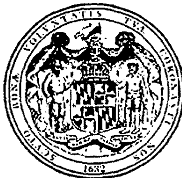
Paul B. Anderson Charter Division

301 West Preston Street, Baltimore, Maryland 21201 Telephone Balto. Metro (410) 767-1340 / Outside Balto. Metro (888) 246-5941 MRS (Maryland Relay Service) (800) 735-2258 TT/Voice Fax (410) 333-7097