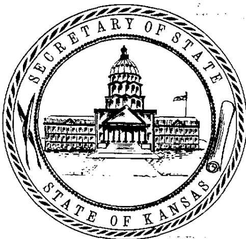
RON THORNBURGH SECRETARY OF STATE

In testimony whereof: I hereto set my hand and cause to be affixed my official seal. Done at the City of Topeka, this 2nd day of September, A.D. 2004