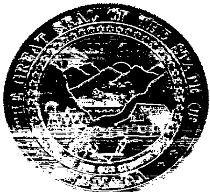
DEAN HELLER Secretary of State

IN WITNESS WHEREOF, I have hereunto set my hand and affixed the Great Seal of State, at my office, in Carson City, Nevada, on June 17, 2004.