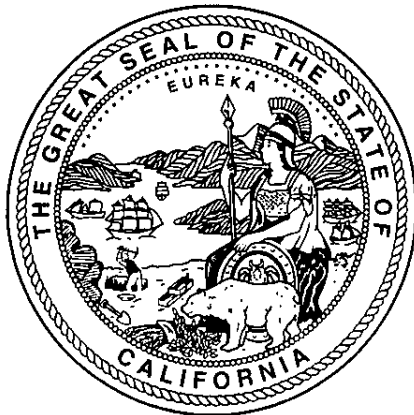
DEBRA BOWEN Secretary of State

A handwritten signature in cursive script that reads "Debra Bowen".