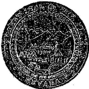
Dean Heller Secretary of State

IN WITNESS WHEREOF, I have hereunto set my hand And affixed the Great Seal of State, at my office, in Carson City, Nevada, on March 31, 2004.