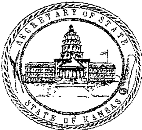
RON THORNBURGH SECRETARY OF STATE

I hereto set my hand and cause to be affixed my official seal. Done at the City of Topeka, this 6th day of November, A.D. 2003