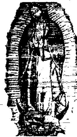
Mother of the Immaculate Patroness of the Unborn