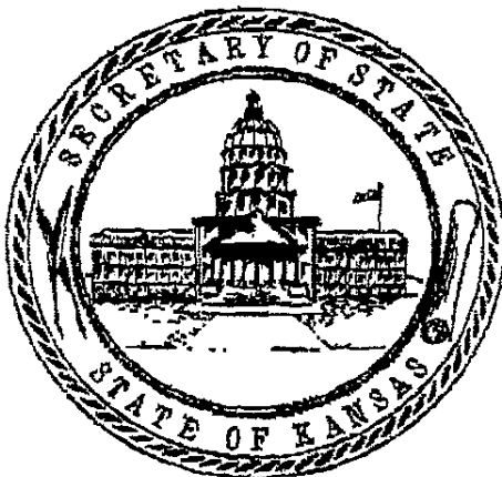
RON THORNBURGH SECRETARY OF STATE

In testimony whereof: I hereto set my hand and cause to be affixed my official seal. Done at the City of Topeka, this 19th day of June, A.D. 2003