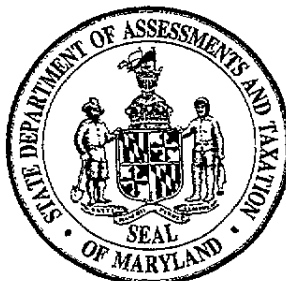
Paul B. Anderson Charter Division