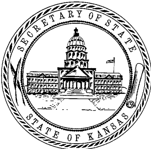
RON THORNBURGH SECRETARY OF STATE

In testimony whereof: - I hereto set my hand and cause to be affixed my official seal. Done at the City of Topeka, this 22nd day of January, A.D. 2002