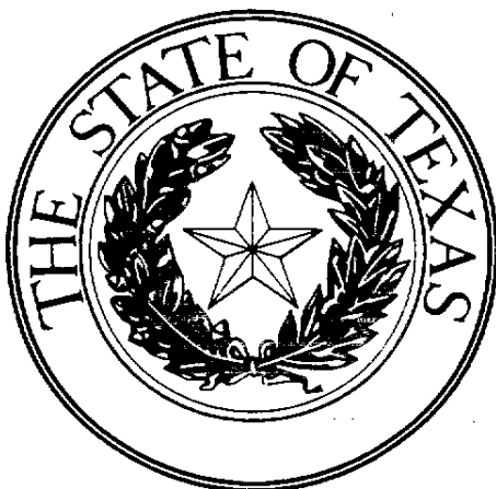
Henry Cuellar Secretary of State

IN TESTIMONY WHEREOF, I have hereunto signed my name officially and caused to be impressed hereon the Seal of State at my office in Austin, Texas on February 8, 2001.