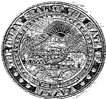
Secretary of State

IN WITNESS WHEREOF, I have hereunto set my hand and affixed the Great Seal of State, at my office, in Carson City, Nevada, on April 12, 2001.