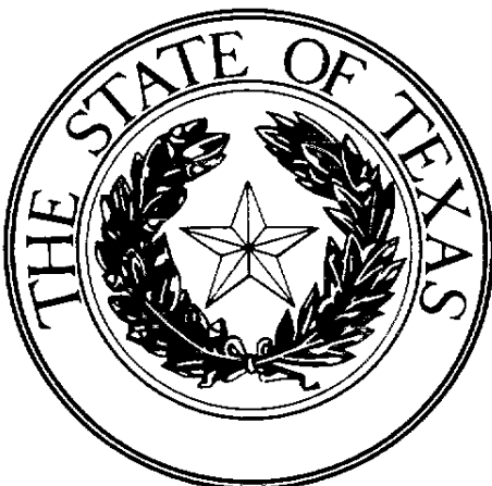
Henry Cuellar BAM Secretary of State

IN TESTIMONY WHEREOF, I have hereunto signed my name officially and caused to be impressed hereon the Seal of State at my office in Austin, Texas on April 26, 2001.