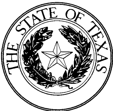
Henry Cuellar Secretary of State DAA

IN TESTIMONY WHEREOF, I have hereunto signed my name officially and caused to be impressed hereon the Seal of State at my office in Austin, Texas on May 7, 2001.