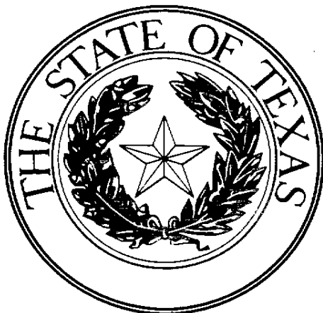
Henry Cuellar VT Secretary of State

IN TESTIMONY WHEREOF, I have hereunto signed my name officially and caused to be impressed hereon the Seal of State at my office in Austin, Texas on February 27, 2001.