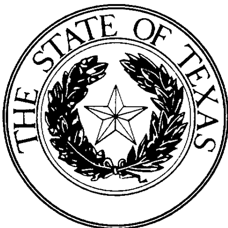
Henry Cuellar DAE Secretary of State

IN TESTIMONY WHEREOF, I have hereunto signed my name officially and caused to be impressed hereon the Seal of State at my office in Austin, Texas on April 27, 2001.