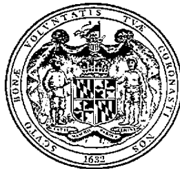
Paul B. Anderson Charter Division

301 West Preston Street, Baltimore, Maryland 21201 Telephone Balto. Metro (410) 767-1340 / Outside Balto. Metro (888) 246-5941 0001105936 MRS (Maryland Relay Service) (800) 735-2258 TT/Voice Fax (410) 333-7097