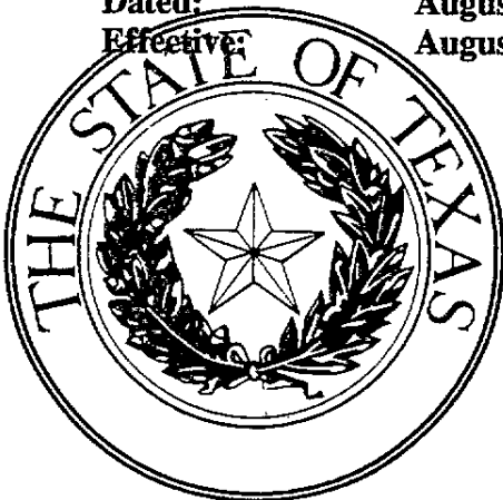
Elton Bomer Secretary of State

Dated: August 14, 2000 Effective: August 14, 2000