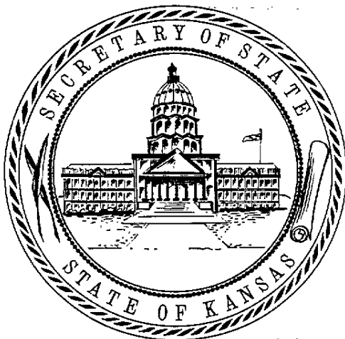
RON THORNBURGH SECRETARY OF STATE

I hereto set my hand and cause to be affixed my official seal. Done at the City of Topeka, this 10th day of October, A.D. 2000