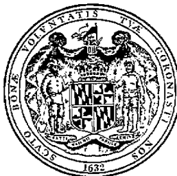
Paul B. Anderson Charter Division

301 West Preston Street, Baltimore, Maryland 21201 Telephone Balto. Metro (410) 767-1340 / Outside Balto. Metro (888) 246-5941 0000869664 MRS (Maryland Relay Service) (800) 735-2258 TT/Voice Fax (410) 333-7097