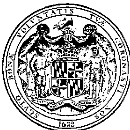
Paul B. Anderson Charter Division