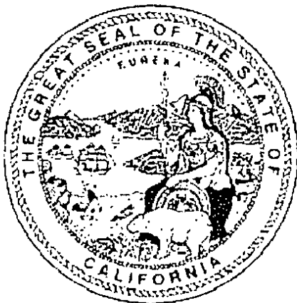
SHIRLEY N. WEBER, PH.D. Secretary of State

IN WITNESS WHEREOF , I execute this certificate and affix the Great Seal of the State of California this day of June 23, 2022.