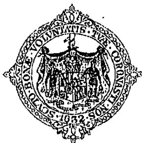
Paul B. Anderson Charter Division

301 West Preston Street, Baltimore, Maryland 21201 Telephone Balto. Metro (410) 767-1344 / Outside Balto. Metro (888) 246-5941 0006735740 MRS (Maryland Relay Service) (800) 735-2258 TT/Voice Fax (410) 333-7097