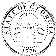
Brian P. Kemp Secretary of State

Docket Number : 15729528 Date Inc/Auth/Filed: 04/04/2018 Jurisdiction : Georgia Print Date : 04/06/2018 Form Number : 211