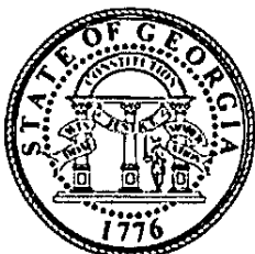
Brian P. Kemp Secretary of State

Docket Number : 12110178 Date Inc/Auth/Filed : 12/16/2013 Jurisdiction : Georgia Print Date : 7/28/2015 Form Number : 211