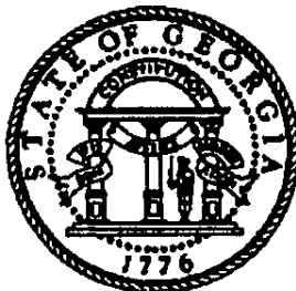
Karen C Handel Secretary of State

WITNESS my hand and official seal in the City of Atlanta and the State of Georgia on September 19, 2007.