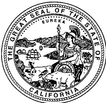
BRUCE McPHERSON Secretary of State

IN WITNESS WHEREOF , I execute this certificate and affix the Great Seal of the State of California this day of July 10, 2006