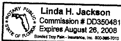
(Notary Public, State of Florida at Large) Notary Seal/My Commission Expires: