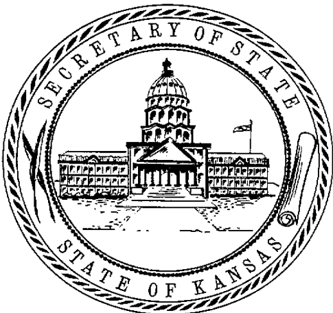
RON THORNBURGH SECRETARY OF STATE

I hereto set my hand and cause to be affixed my official seal. Done at the City of Topeka, this 11th day of September, A.D. 2002