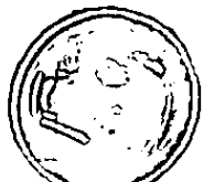
5. Tomato Soup 番茄