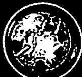
2. Herbal Soup 滋補