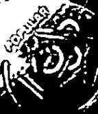
7. Tom Yum Soup 酸辣