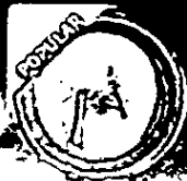
4. Pork Bone Soup 筒骨