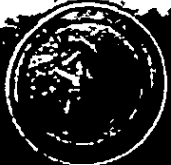
6. Miso Soup 味噌