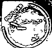
3. Spicy Soup 麻辣