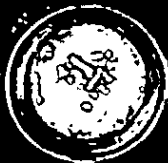
1. Original Soup 筒骨