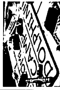
Camp Dolphin is Just For Kids!

programs, including arts, crafts, movies, board games, video and arcade games, nightly themed activities with cool prizes and souvenirs, a Disney movie and even a special dinner program. Camp Dolphin is staffed by a team of caring counselors. Parents can rest assured that their little ones will be well taken care of in a safe and fun environment.