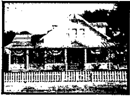
Located in the Historic Captain H. B. Jeffries Home