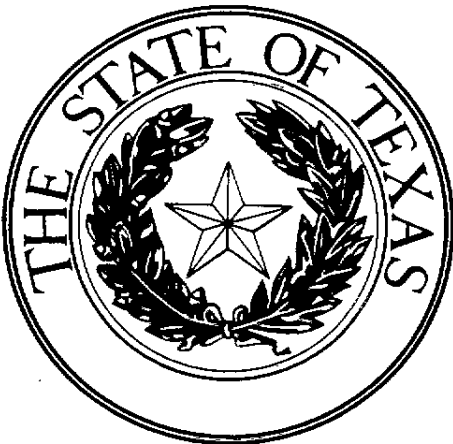
Alberto R. Gonzales Secretary of State

IN TESTIMONY WHEREOF, I have hereunto signed my name officially and caused to be impressed hereon the Seal of State at my office in the City of Austin, on June 5, 1998.