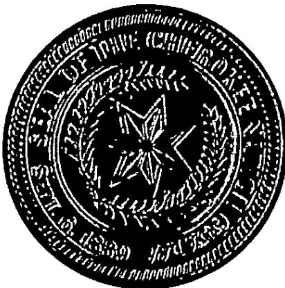
Chuck Hoskin Jr., Principal Chief Cherokee Nation

IN TESTIMONY WHEREOF, I hereunto set my hand and cause to be affixed the Great Seal of the Cherokee Nation, done at the City of Tahlequah, this Eleventh day of October, 2019.