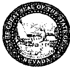
BARBARA K. CEGAVSKE Secretary of State

Electronic Certificate Certificate Number: C20160831-0062 You may verify this electronic certificate online at http://www.nvsos.gov/