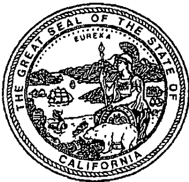
ALEX PADILLA Secretary of State

IN WITNESS WHEREOF, I execute this certificate and affix the Great Seal of the State of California this day of July 17, 2015.