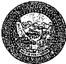
ROSS MILLER Secretary of State

Electronic Certificate Certificate Number: C20140206-2811 You may verify this electronic certificate online at http://www.nvsos.gov/