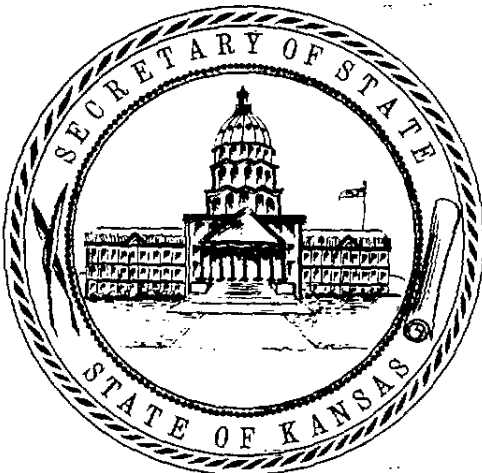
RON THORNBURGH SECRETARY OF STATE

I hereto set my hand and cause to be affixed my official seal. Done at the City of Topeka, this 21 st day of April, A.D. 2003