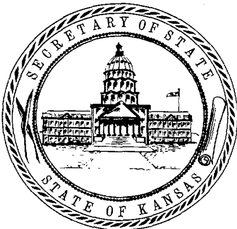
RON THORNBURGH SECRETARY OF STATE

I hereto set my hand and cause to be affixed my official seal. Done at the City of Topeka, this 1st day of April, A.D. 2003