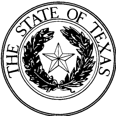
Alberto R. Gonzales Secretary of State

IN TESTIMONY WHEREOF, I have hereunto signed my name officially and caused to be impressed hereon the Seal of State at my office in the City of Austin, on July 2, 1998.