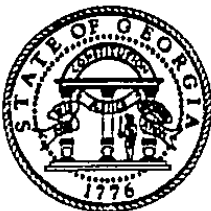
MAX CLELAND SECRETARY OF STATE