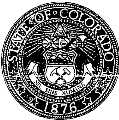
Secretary of State of the State of Colorado

FILED APR 16 P 4:49 REGAN JOSEPH RUTHERFORD