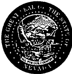
BARBARA K. CEGAVSKE Secretary of State

Electronic Certificate Certificate Number: C20150729-0835 You may verify this electronic certificate online at http://www.nvsos.gov/