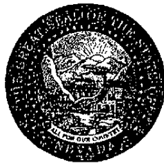
BARBARA K. CEGAVSKE Secretary of State

Electronic Certificate Certificate Number: C20150609-0113 You may verify this electronic certificate online at http://www.nvsos.gov/