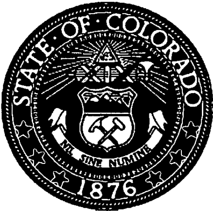
Secretary of State of the State of Colorado